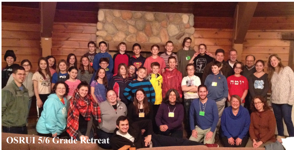
OSRUI 5/6 Grade Retreat