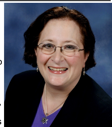
From Rabbi Binah Wing

There are not words enough to express my gratitude, and that of my extended family, to all of you for all that you did to care for us following my mother's death last month. We were amazed and so touched by all of the notes, texts, calls, FOOD, love and care you showed to us during our time of grief.